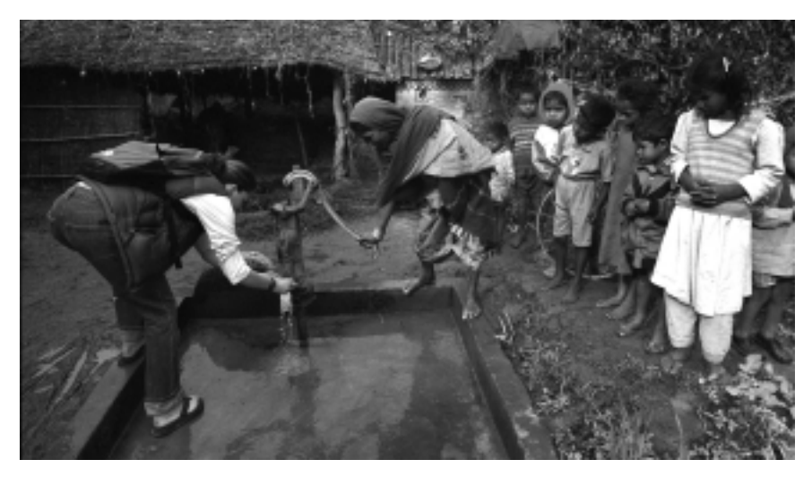
Photo by Donna Coveney for the MIT Nepal Water Project. http://web.mit.edu/watsan/project_nepal.htm

http://web.mit.edu/newsoffice/2004/nepal.html