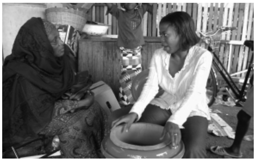
Photo by Rachel Peletz for the Pure Home Water Project. http://web.mit.edu/watsan/project_ghana.htm