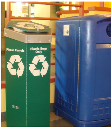
W20 Student Center Lobby

The popular and long-anticipated single stream recycling program was launched this spring in all CAC buildings and we've been busy purchasing new containers to keep up with demand. No longer do folks need to use separate bins for cans, bottles, and paper. Now you can place all recyclable materials into the same container and rely on the off-campus sorting facility to sort and recycle it. What can you place in these containers?