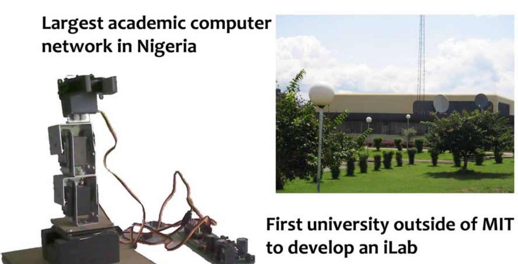
Significant progress in integrating iLabs into curriculum