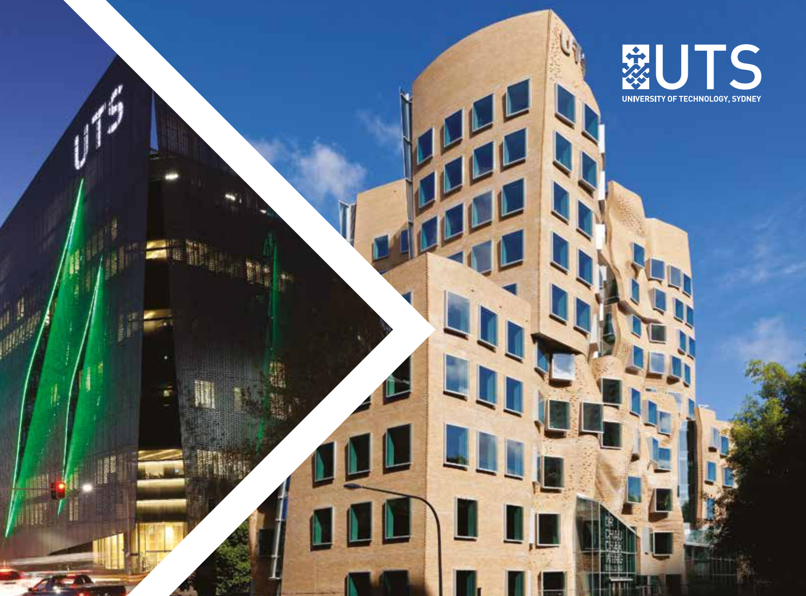
Faculty of Engineering and IT (Left), UTS Business School (Right).